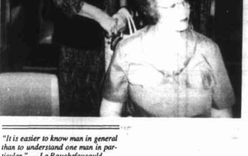
"It is easier to know man in general than to understand one man in particular." — La Rouchefoucauld